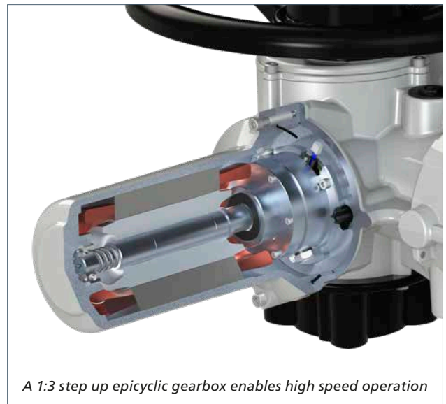
A 1:3 step up epicyclic gearbox enables high speed operation

IQH actuators have been developed for diverter valves in meter prover applications that require fast operation with positive seating and zero backdriving.