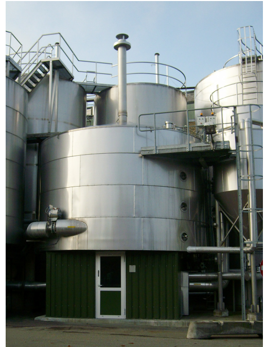
The whirlpool, where solid materials are separated out from the wort prior to fermentation.

must be regulated through repeated measurements to ensure that the beer will adhere to a predetermined standard of quality.